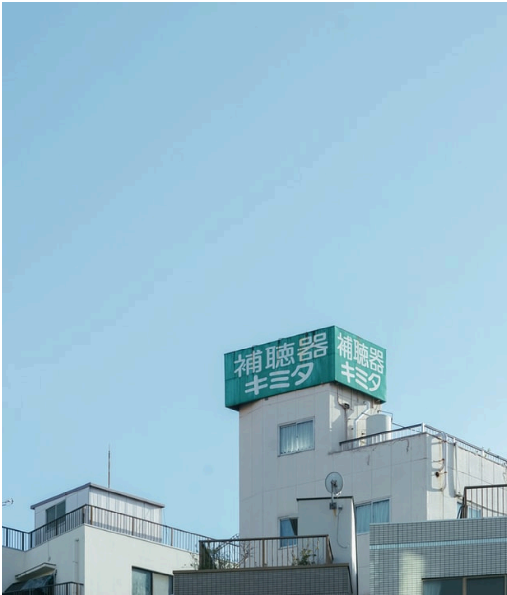
Abbildung 1. Image description for image One.